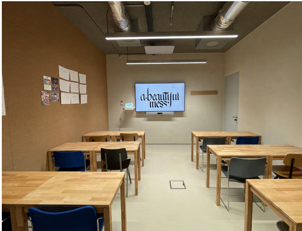
MEETING ROOM 1

We're happy to rent out the rooms where our employees receive Dutch lessons. These spaces come with screens, chairs, and tables, all of which can be arranged to suit your needs. We're flexible and ready to work together with you, to ensure the setup meets your requirements.