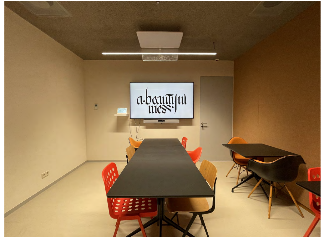
MEETING ROOM 2